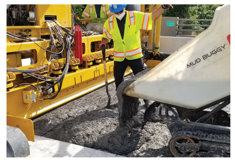
Ductal material being transported and placed with a specialized UHPC paver