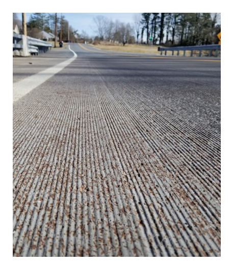
Milled Ductal riding surface on a bridge deck, one year after installation

Ductal Overlay is a thixotropic, ultra-high performance concrete (UHPC) specifically engineered to provide high mechanical strength, very low permeability, and ultra-high durability for horizontal applications such as bridge decks, warehouse floors, and building slabs.