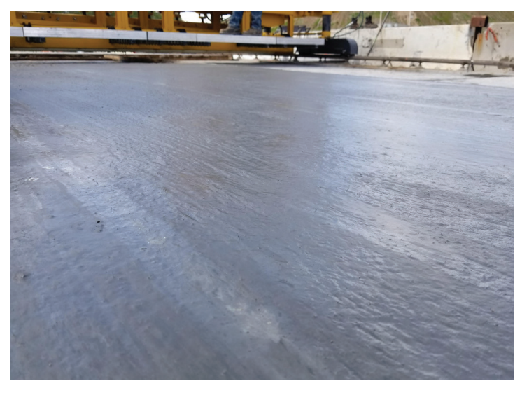
Ductal Overlay surface finish following placement with a paver